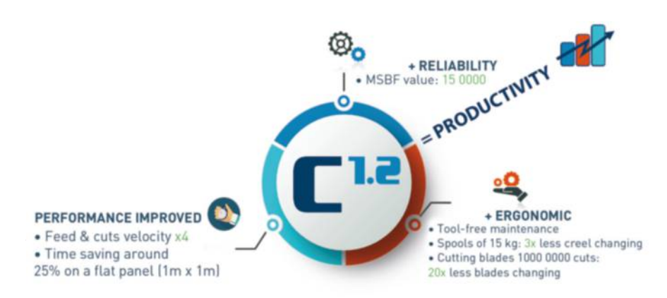
Fig. 3: Increasing productivity with the C1.2

more than 1.5 m/s during layup) with improved reliability, thanks to motorised modules used in the creel, accommodating fibre spools up to 15 kg of raw material, i.e., 3 times more material on board combined with a better management of the dancing arms which improve the material flow (Figure 3). Three infrared lamps are supplied as standard to go faster, saving time once again on the link paths. The equipment also provides cleaner, straighter fibre cuts, even at high speeds, and better feeding. Moreover, the C1.2 can use very thick materials, crucial to increase the productivity, generally defined by the mass of material deposited over a given period of use.