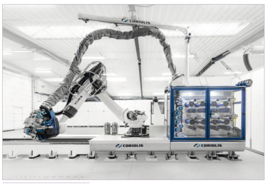
Fig. 1: The C1.2 is a compact, easy-to-use and versatile machine for depositing multi-materials (thermoset, thermoplastic and dry fibre)

Using composite materials for structural parts in aeronautics is not new: aircraft manufacturers such as Airbus and Boeing did it in their latest industrial programs, Airbus A350 and Boeing 787. By doing so, they manage to reduce the weight of the aircraft, resulting in a significant lower fuel consumption. Composites materials indeed have a major role to play in decarbonating air transport.Automated Fibre Placement (AFP) makes it possible to apply high-performance