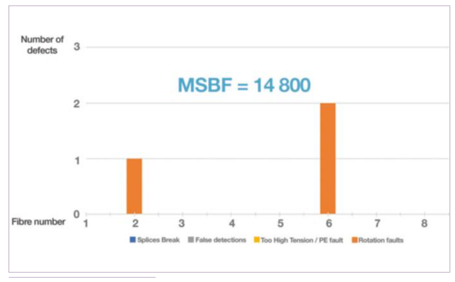
Fig. 4: Mean Swap Before Failure (MSBF) test results

Reliability and productivity are important, but ease and ergonomics of the machine maintenance too. Routine head maintenance operations can now